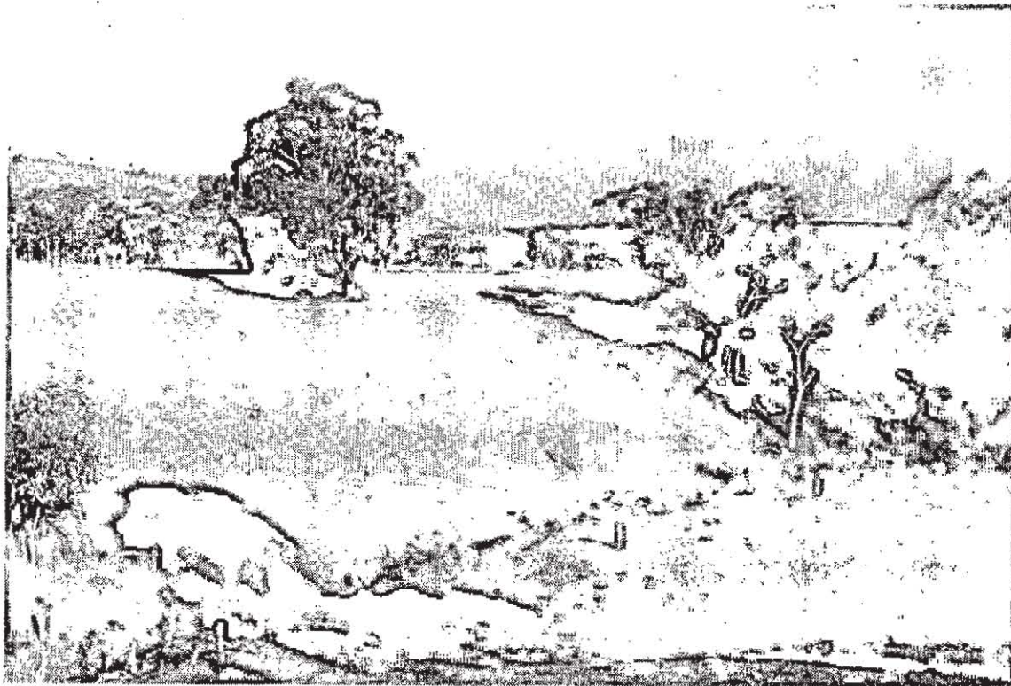
Plate 1: Revegetation of 3 rd order watercourse, September 1990.