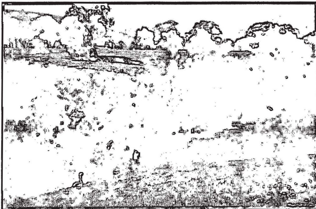
Plate 2: The same site as in Plate 1, five years later, October 1995.