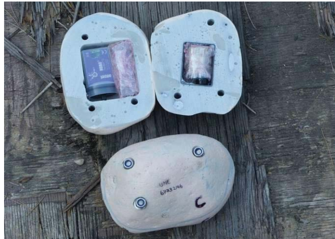
Figure 3. Smart Rocks design housing a triaxial logging accelerometer to record rock movement, GPS logger to record the travel path, and a radiotracker to locate rocks after movement.

Five identical Smart Rocks (130mm a-axis, 92mm b-axis, 65mm c-axis) were designed and built from weighted resin using a cast of a river stone from the study site and contained specialised electronics sourced from a range of suppliers: Onset triaxial logging accelerometer, G10 Ultralite GPS logger and radiotracker in a waterproof housing (Figure 3). Smart Rocks were placed at the top of the study reach in October 2015, and their precise location within the DEM recorded.