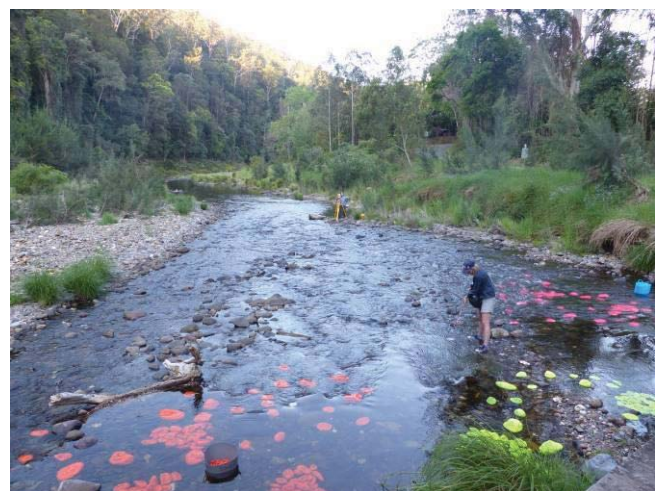
Figure 2. Surveying the location of the 1290 painted tracer rocks and Smart Rocks in the Bellinger River.

A DEM was constructed for a 150m reach of the Bellinger River in coastal NSW based on high-resolution, quantitative topographic data acquired using a (TOPCON GTS701, TOPCON Positioning Services, USA) total station and reflector-prism. Flow velocity was measured simultaneously with topographic data by attaching a Marsh McBirney FlowMate (Hach Industries, USA) to the end of the reflector-prism pole. Water depth was also recorded for all data points. Surveys exceeded densities >1 \text{ point m}^{-2} and were feature-based with point densities increasing ( >1 \text{ point m}^{-2} ) around topographic breaks in slope (e.g. thalweg, and bedrock) (Wheaton et al., 2010) and abrupt changes in flow velocities (e.g. > 0.20 \text{ msec}^{-1} ). Extra data points were collected on bank and bars where possible to provide context for the wetted channel.