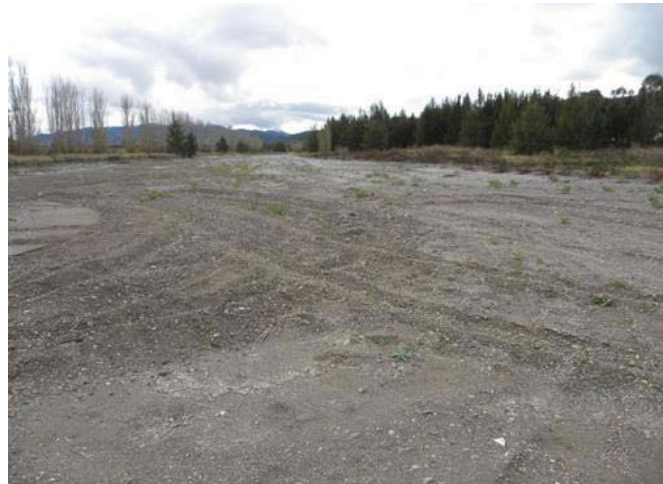
Figure 1. The main channel of the lower Pages River showing the fine sediment filling over 1.5m of channel depth for many kilometers upstream.

Fine sediments were analysed for multiple tracers including; physical characteristics (colour, particle size and organic matter), major and trace elements (XRF - X-Ray Fluorescence, Inductively Coupled Plasma Mass Spectrometer - ICPMS), and stable carbon and nitrogen isotopes. Spatial data were used to construct a digital elevation model (DEM – 30m resolution), flow accumulation models of catchment boundaries and drainage lines, slope and erodibility maps, and a radiometric map of the distribution of different geologies and the movement of sediment within the Pages River trunk based on levels of potassium, thorium and uranium.