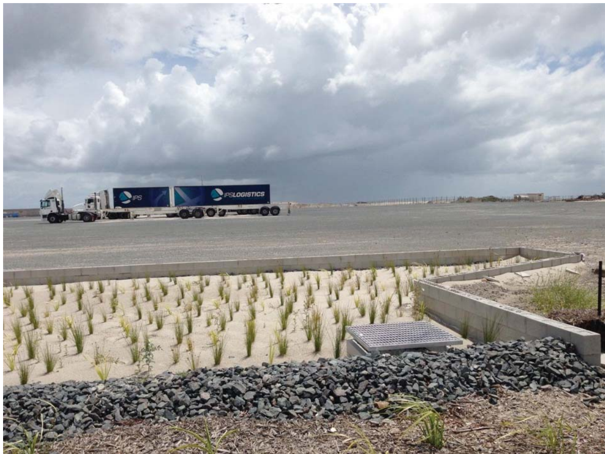
Figure 2. Example of a Bioretention basin at the Port of Brisbane

* Another benefit to the client is they get access to land that they are paying rent for that would have been used for stormwater treatment.